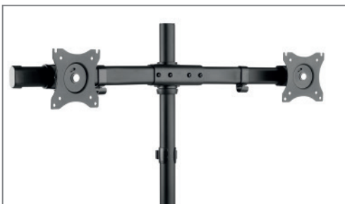
cable routing via cable clips