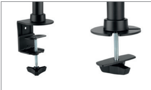
clamp or screw mounting possible